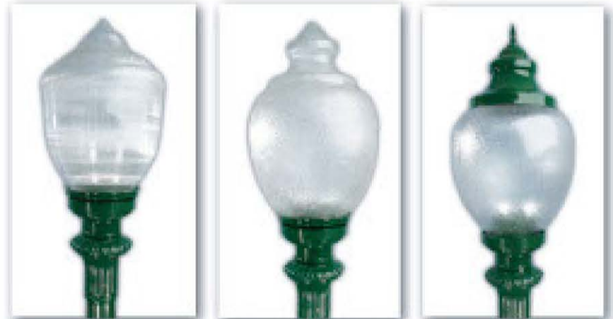
NJD 15 1/4" x 37" NJE 16" x 42" NJG 16" x 40"