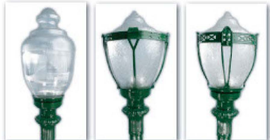
NJH 16" x 45" NJK 17" x 35" NJL 17" x 35"