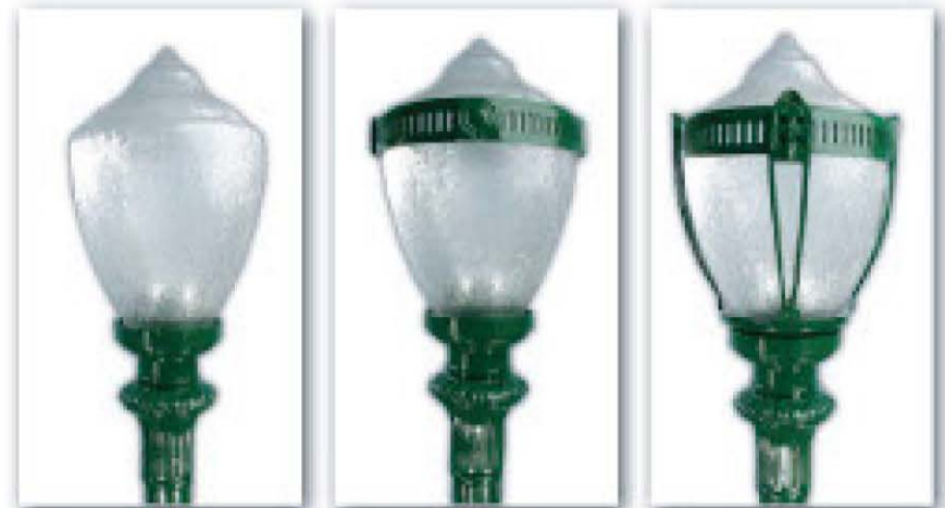
NJA 15 1/4" x 35" NJB 16" x 35" NJC 17" x 35"